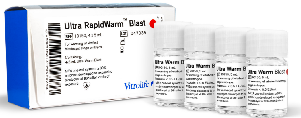
Works with all cleared vitrification solutions and devices.

In addition, studies present that blastocysts warmed in a low sucrose medium show a tendency for faster re-expansion 4 and shorter time to hatching 5 .